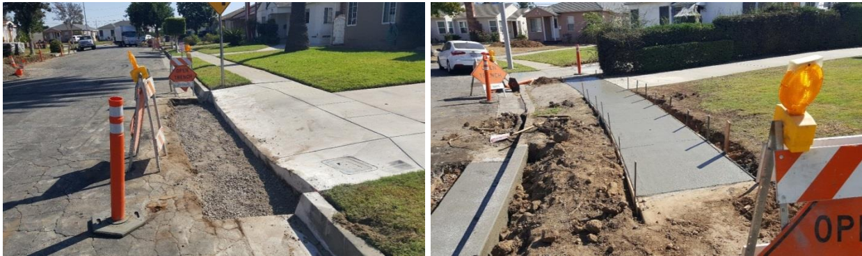
Street Improvements at Holger Drive (Concrete Repairs)

STREET AND INTERSECTION PAVEMENT REHABILITATION (CP No. 872) – The project calls for various street and intersection pavement rehabilitation and sidewalk improvements, on the following streets: Weimar Way (Avenida De La Merced to Los Amigos Avenue), Madison Avenue (Taylor Avenue to 12 th Street), Holger Drive (Victoria Avenue to Forbes Avenue), and Via Campo at Vail Intersection. On August 28, 2019, the City Council awarded the construction contract to Sequel Contractors, Inc. the contractor has distributed notices and posted the areas. On Monday, October 28, 2019, construction crews began work at Holger Drive (see photos below).